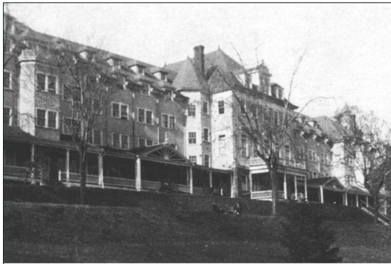
Missionary Training Institute, circa 1910

The first Bible college in North American history, founded by A.B. Simpson in 1882, was devoted to serving unreached people and inspiring the church to fulfill Jesus' commission of world evangelization (Matthew 28:18-20).